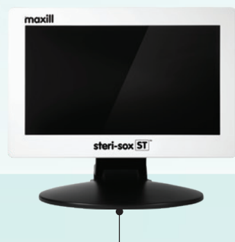
steri-sox ST Tabletop Stand