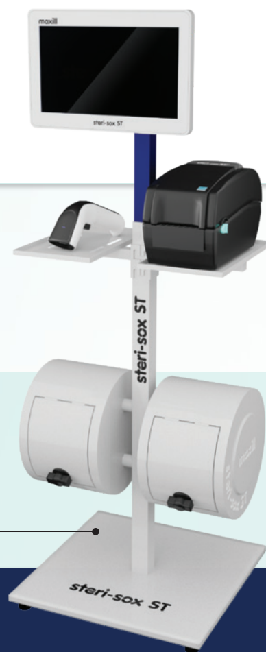
steri-sox ST Floor Stand Kit with Printer Trays and Storage Canisters