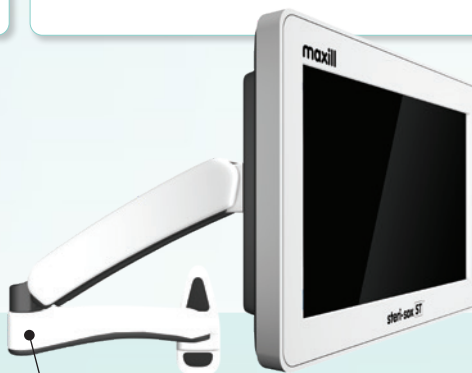
steri-sox ST Wall Mount Arm