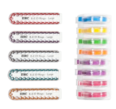
E-Z ID Rings & Tape

Take your organization one step further with E-Z ID Rings & Tape, using one color to identify practitioner and a second color to identify the procedure. To eliminate confusion between the doctor and assistant and improve the patient experience, E-Z ID Rings can be placed in a diagonal pattern to show the order of use.