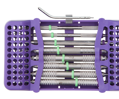
Example of Color Coding with E-Z ID Rings