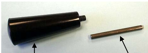
New Style Handle